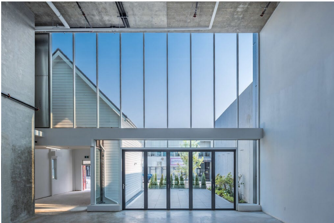
Figure 1 – ExtraClear™ Flat Glass

This EPD is valid for the ExtraClear™ flat glass (uncoated) products.