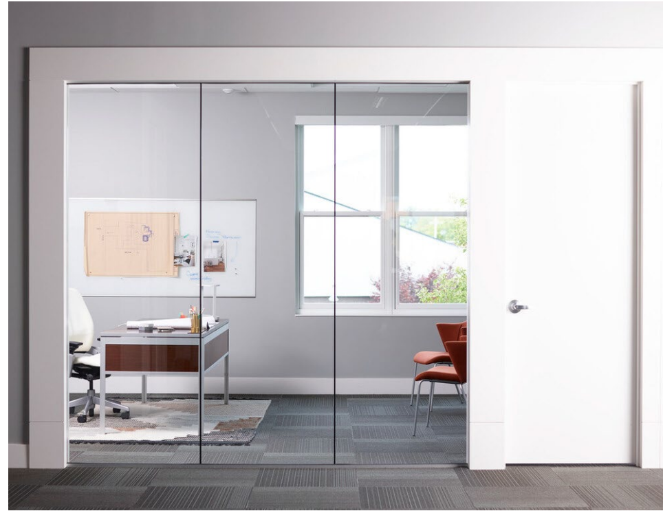
Figure 1 - UltraClear™ Flat Glass

This product-specific EPD was developed based on the Guardian Glass EU Cradle-to-Grave Flat Glass Life Cycle Assessment. The EPD accounts for raw material extraction and processing, transport, and product manufacturing, use, and disposal. Manufacturing data were gathered directly from company personnel. When updated company-specific data were not available the ratio of production units, within the calendar year 2021, was used as a proxy.